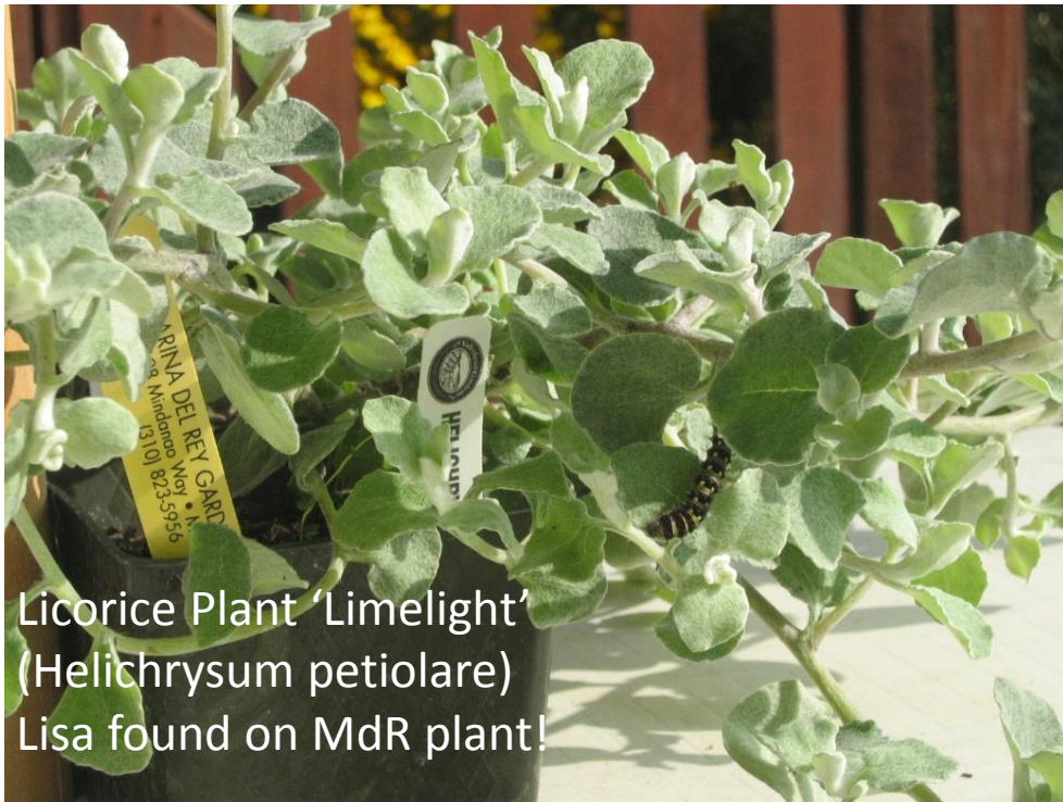
Licorice Plant 'Limelight' ( Helichrysum petiolare ) Lisa found on MdR plant!