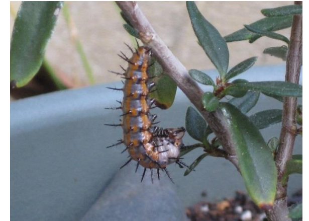
Going into a cocoon