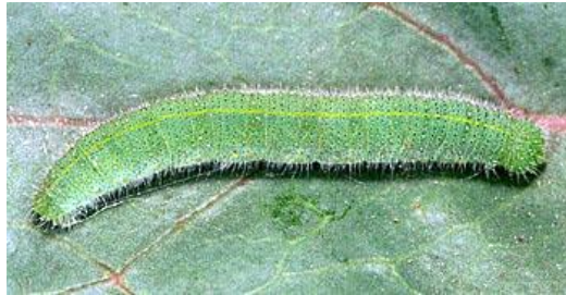
Larvae food plants: Mustard family